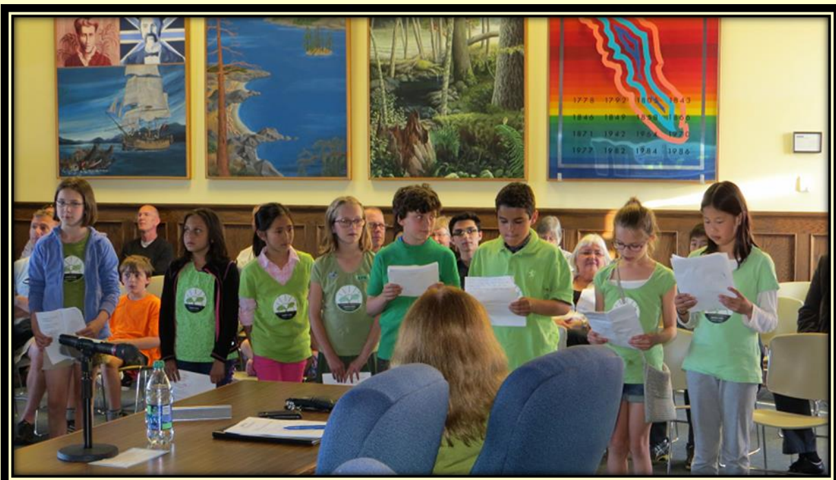
The Green Team